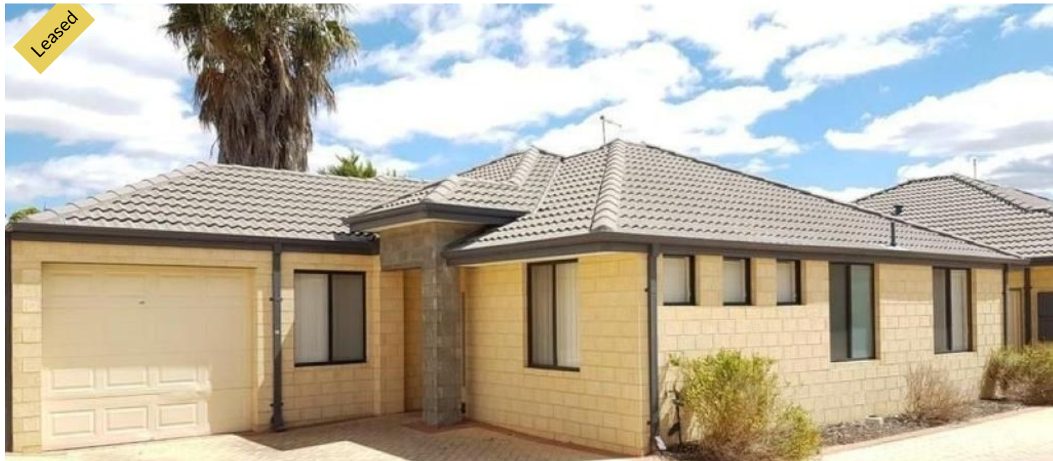
Unit 10, 309 Railway Ave, Armadale