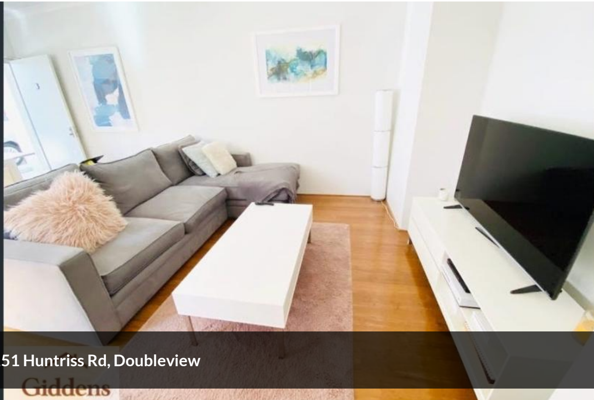
Unit 3, 151 Huntriss Rd, Doubleview